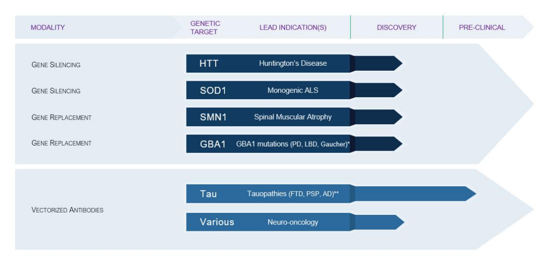
Voyager is partnering with Neurocrine Biosciences on a Friedreich's Ataxia (FA) program and two other undisclosed programs, each at the discovery stage. Voyager has an option to either co-develop/co-commercialize the FA program in the U.S. or to grant Neurocrine global commercial rights.

Our pipeline of early-stage gene therapy programs is summarized in the table below: